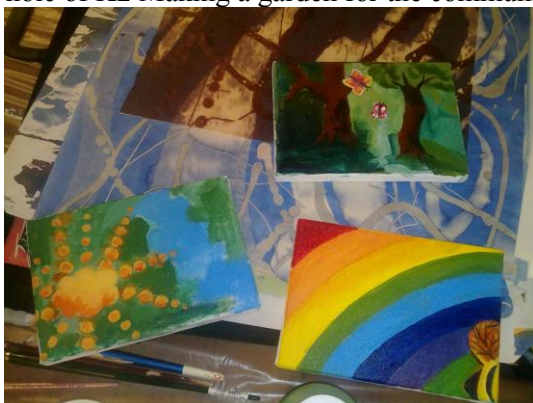
Acrylics – whole class design Y6