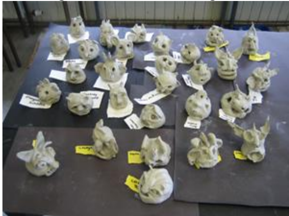
Gargoyles KS2/3 "Buildings"