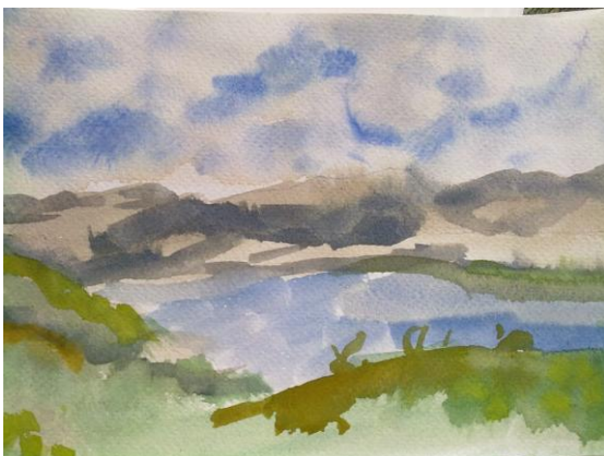
Watercolour from visit to Borrowdale – developing use of language Y6