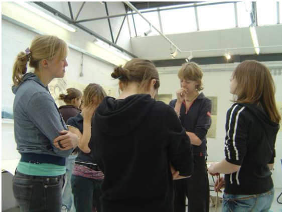
Y9 – Thinking about emotions prior to expressive drawing