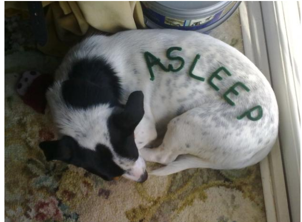
Text and Image KS3