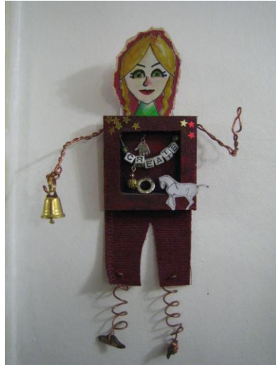
MiniMii KS2 "Self Image"