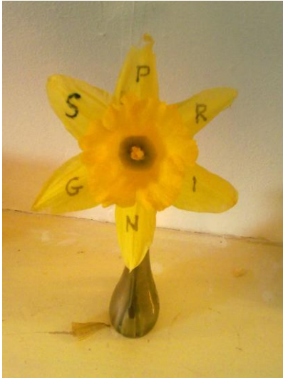
Text Art Y5 Developing language use