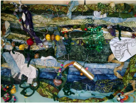
“Illustration” of song written by Y6, by Y6