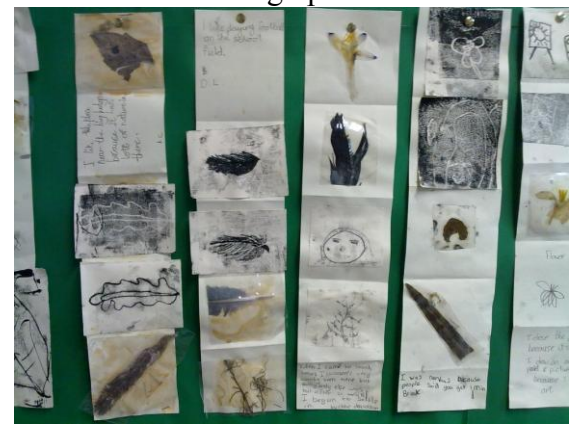
Experiments in exploring our immediate environment Y5