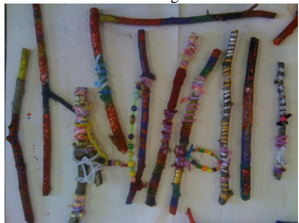
Merz Barn – "Snakes Sticks" Y4