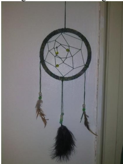
Taking Control of Bad Dreams – SEAL Y5/6