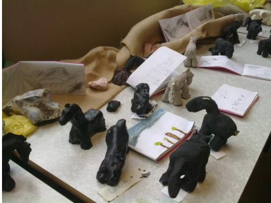
Clay Fell Ponies Y3