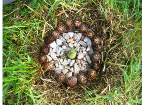
Land Art Y2