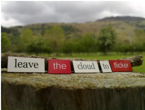
Using the Outside to Develop Language Y5