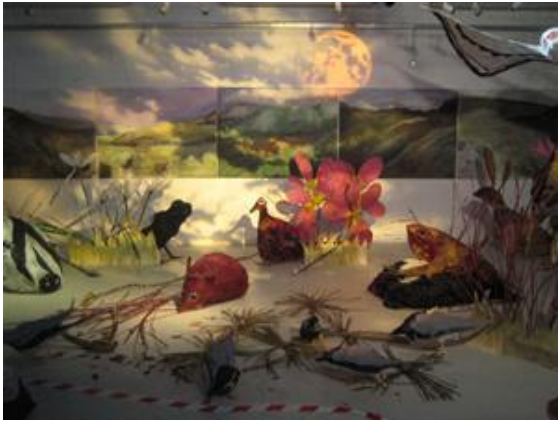
The Big Draw with Natural England 2008