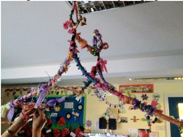
Making the entrance exciting! KS1