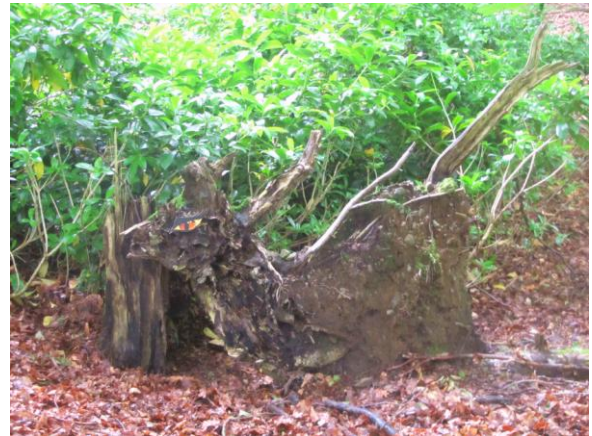
Art outside to develop language Year 4 (A tree stump becomes a dragon)