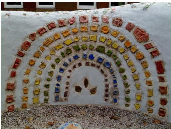
Whole of K2 Making a garden for the community