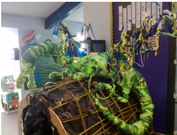
Dragon – KS2 History