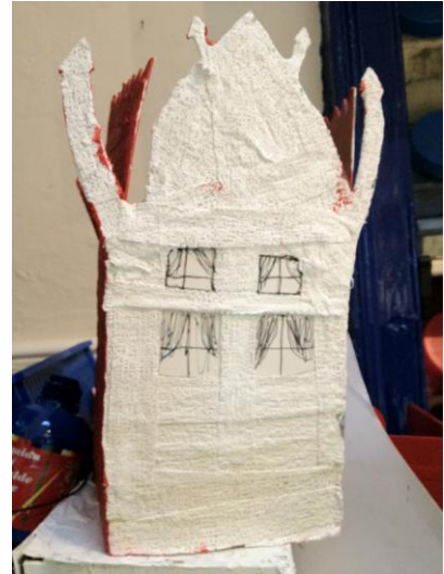
Own Choice "Fantasy" theme Y4