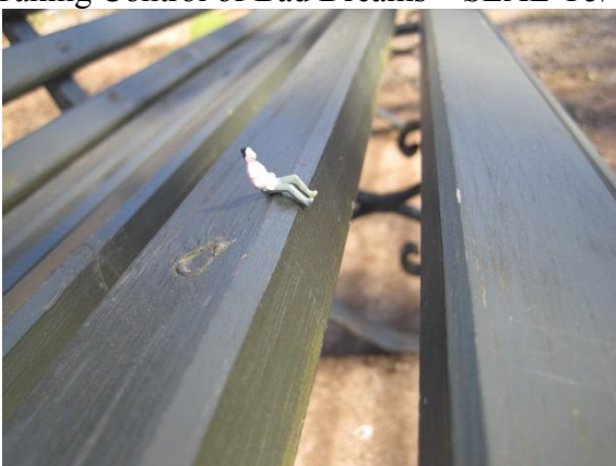
Little People In Penrith Y5 Digital Art and installations