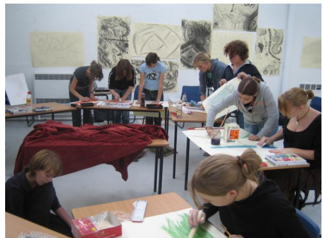
Markmaking Workshop Y9 The Big Draw