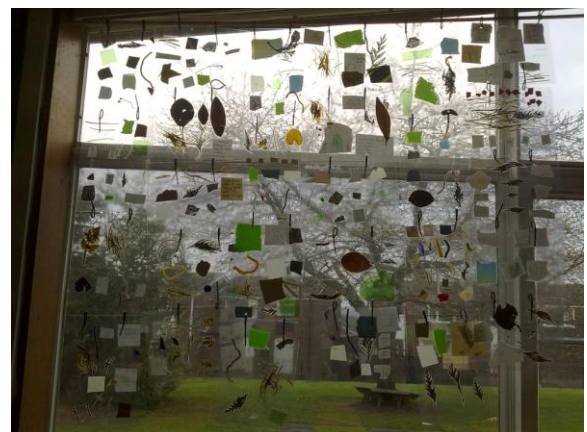
Exploring our School Environment Y5