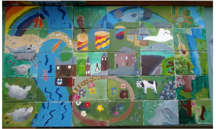
Whole class Acrylic “Where We Live” Deekabout project Y6