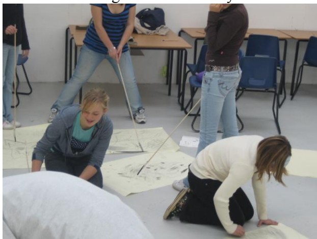
Expressive Drawing Y9