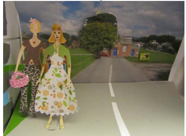
Diorama – Ways to School Y5