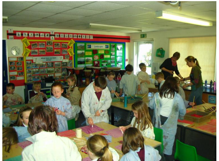
Workshop in progress